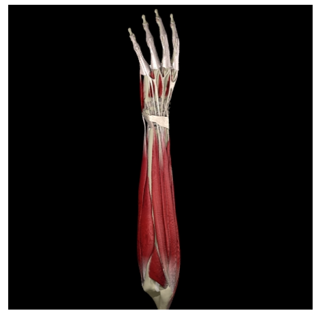
Interactive Hand 2000 © 2001 Primal Pictures Ltd