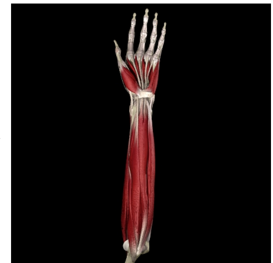
Interactive Hand 2000

As was previously mentioned, all of these muscles attach up at the elbow. If you were to stand with the arm straight at your side and the palm facing forward, you will be able to feel a bony prominence at the elbow on the side closest to the body. This is called the medial epicondyle. The muscles on the front of the forearm are collectively called the flexor muscles. Although there are many different muscles and many different layers of muscles, the vast majority of these muscles attach to this medial epicondyle through what is known as the common flexor tendon. There is a similar situation on the back of the forearm as well. The muscles on the back of the arm are known as the extensor muscles. The various extensor muscles attach to the lateral epicondlye, which is the body prominence on the outside of the elbow opposite the medial epicondyle.