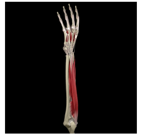
Interactive Hand 2000

The hand is a very complicated area and as such there are a very large number of muscles that are associated with the hand and wrist. The majority of these muscles, especially the stronger muscles, actually run all the way from the hand, up the forearm and attach at the elbow. You can easily test this yourself by squeezing your forearm and firmly opening and closing your hand. You will feel the muscles in the forearm contract and relax as you open and close the hand. It is important to realize that even though it is a small area, there are many different muscles that attach at the elbow and travel down to the hand. These muscles are arranged in layers, and each muscle within each layer has a different job, or function. For example some of the muscles in the most superficial layer, that is the layer right under the skin, travel down and attach to the wrist. When they contract they act to flex and extend the wrist. Some of the muscles in the middle and deeper layers attach all the way into the fingers and when they contract they move the fingers, such as when making a fist or picking up objects. These deeper muscles that move the fingers have many separate tendons that go to each individual finger. This makes it possible to move one finger by itself, and enables us to carry out tasks requiring fine motor skills such ay typing, buttoning a shirt, or playing the guitar.