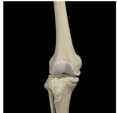
Interactive Knee 1.1

The knee consists of three bones – the Femur, Tibia, and the Patella, or knee cap. As the Femur and Tibia come together they form a hinge joint that is designed to move back and forth – movements that we refer to as flexion and extension. As you can see, the knee is designed to allow a large amount of movement, which is great because it permits us to do a wide range of activities such as walking, running, crouching, and kneeling. In order to move properly and protect the area from injury the knee joint relies on a complex system of muscles that surround the area. These muscles include the thigh muscles - know as the quadriceps group, the hamstring muscles, the inner thigh muscles - known as the adductor group, the calf muscles, and also some smaller muscles around the knee, such as the popliteus muscle. Underneath these muscles there is also several strong ligaments that help protect the knee joint. When the muscles are all working properly the knee moves as it should and the chance of pain and injury is very small. Unfortunately, it is common for these muscles to become tight and weak, which can lead to a variety of knee problems.