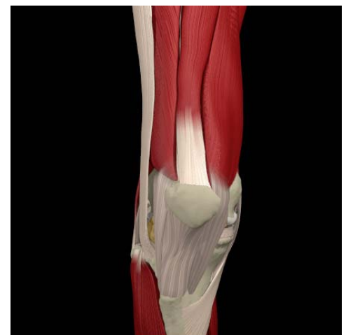
Interactive Knee 1.1 © 2000 Primal Pictures Ltd.